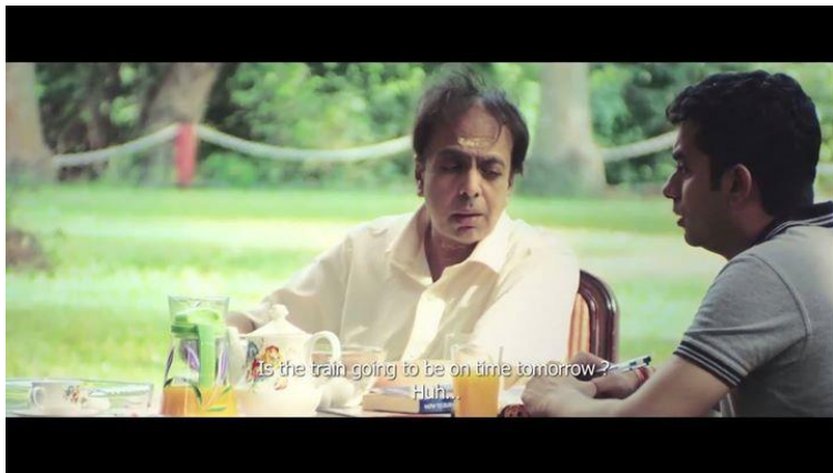
Image 4. Father and son during their breakfast.

Nevertheless, he too has moved away from his position for the sake of his son's recovery. A close-up shot in five minutes of the photo shows the helpless face of a helpless father, who is understood to be just pretending to be tough. How can he handle the boy alone! Then the scene of the train. Shiva, his mother and a friend, are boarding the night train to defend the invitation. The fluent friend does not understand that Shiva's body is feeling bad. Then