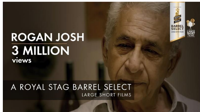
Image 11. Thumbnail of the short film 'Rogan Josh'.