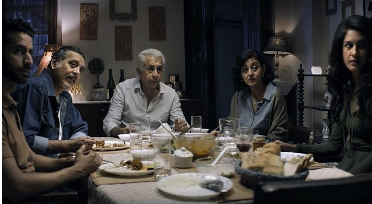
Image 12. The expression of Vijay and others when Rithika enters with her son and colleague.

After this scene, it seems that Vijay's son Varun convey that his wife Rithika has been engaged with her colleague and eventually he also added that Kabir (Varun's son) needs a father as well. This situation does not create any changes. Perhaps, Varun's mother was happy.