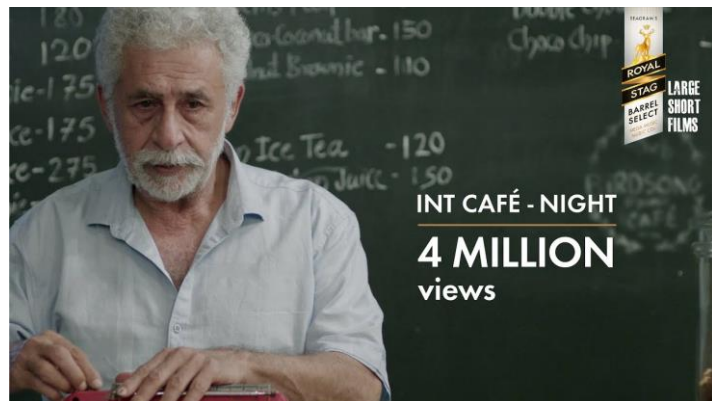
Image 7. Thumbnail of the short film 'Interior Cafe Night'.

In the first scene, the atmosphere of an old cafe floated with Bengali song that has been sung by Manna Dey came to the fore in the background. From that, it infers that the cafe located in some part of Kolkata. The cafe owner is also seen, with white hair and beard giving an idea of his age, but possessing a fresh mind, it reveals in body posture. The context may come to mind; Kolkata is the city of love.